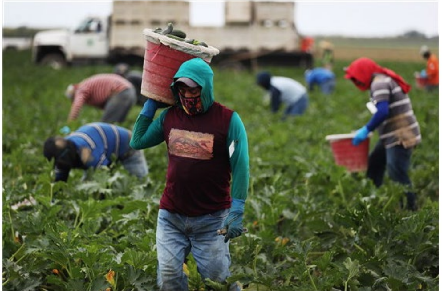
— Farm workers harvest zucchini in Florida City on April 1, 2020.